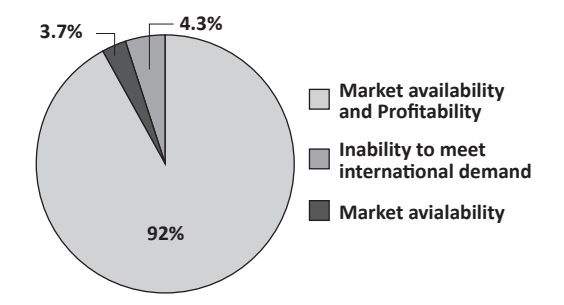
FIGURE 2. Reasons for manufacturers' choice of market for furniture products

The Ghanaian wooden furniture industry is steadily declining in performance, productivity and profits due to lack of raw materials, skilled labour, competition brought about by trade liberalization and high operational costs [27]. These challenges are more pronounced among the large scale companies [28]. According to Söderbom et al. [29], many Ghanaian large-scale firms have shut down due to increasing costs of operations. A few of those remaining have reduced their production capacities drastically due to raw material shortage. It was therefore not surprising to find more small(70%) and medium-scale (25%) furniture firms than the large