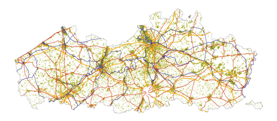
FIGURE 1. Explored contaminated sites in Flanders from the Land register

remediation of new soil contamination. There are several instruments for the implementation of the mentioned policy, and one of them is Soil Information Register, containing quantitative and analytical parameters of soil excavated from contaminated sites in Flanders. The Soil Information Register contains the so called "Soil certificate", available for each of the specified plots with all necessary information about the land parcel. The entire system is carried out by the Waste Agency of Flanders (OVAM). Inventory of potentially polluted land is carried out at the lower administrative levels such as counties (Figure 1).