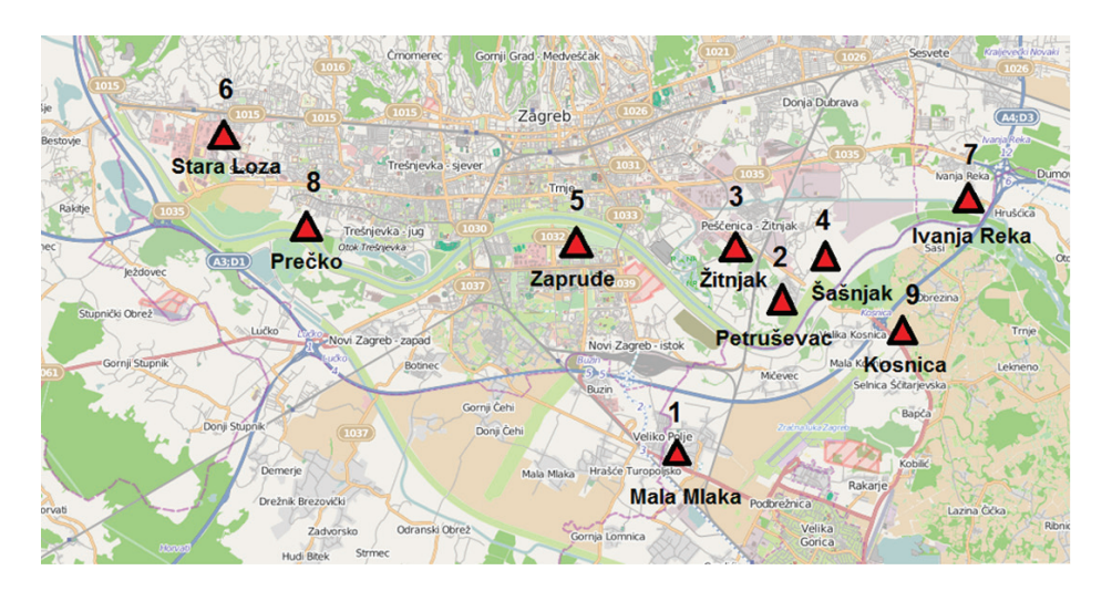
FIGURE 3. Locations of polluted water supply wells in the city of Zagreb (1. High and constant concentrations of atrazine, chromium, lead, cadmium and copper; 2. High concentrations of manganese; 3. High and constant concentrations of organic solvents; 4. High manganese concentrations; 5. Periodically high concentrations of lead; 6. High concentrations of lead, iron, manganese and trichloroethane solvent; 7. Higher concentration of nitrates, lead and organic solvents; 8. Excess of bacteria, cadmium and lead; 9. High concentrations of iron, manganese, zinc, lead and mercury)

as "contaminated" due to the high content of these elements in the soil. It is particularly important to emphasize high concentration of chromium in the wider area of Ravni kotari, which are very famous for their intensive agriculture. According to current regulations and established critical limits, soil in the vicinity is classified as "contaminated" and it is questionable if these areas can be used for "Ecological agricultural production" and fulfil the requirements for obtaining subsidies for ecological farming. However, since these high concentrations are mainly of natural origin, in the area historically committed to agriculture, it is questionable how much in reality these concentrations elevated of chromium represent a "significant risk" to health and the environment, and whether it is necessary to constrain subsidies for food production because of that historical "pollution" and vagueness of existing legislation. In drafting of the new regulations concerning soil contamination, one must take into account the natural load of polluting substances in the soil as well as their realistic environmental risk.