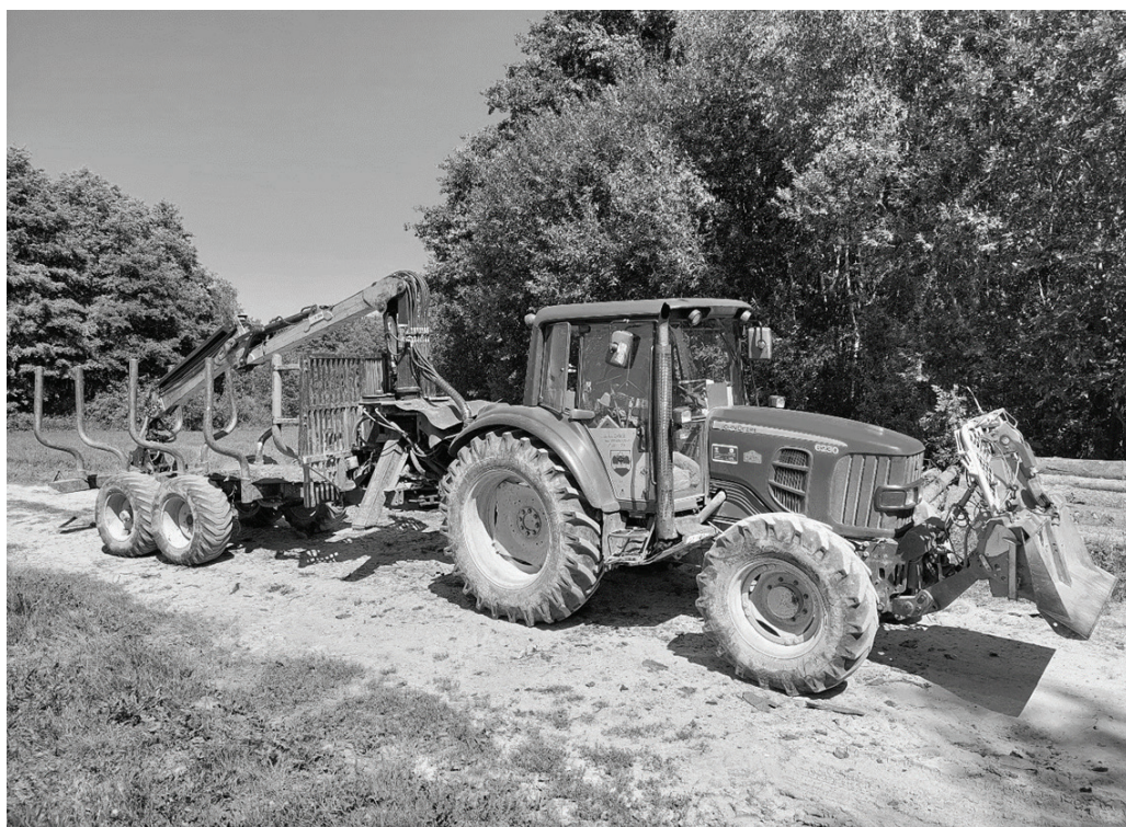
Figure 1. Tractor John Deere 6230 with a timber trailer 10T STS Prachatice.

distribution, and the following test was one-factor ANOVA with a p-value of 0.05 again. Vibrations from the respective operations then differed if the result of the statistical test did not exceed the set value. If the result of the Shapiro-Wilk test was lower than the set p-value, then the data did not correspond to the mentioned distribution. In such a case, a non-parametric (Kruskal-Wallis) test was used whose p-value was again set to 0.05. The operations and their data differed when the test result did not exceed the p-value. For a better representation of the data, descriptive statistics and box plots were created for the respective operations and their data.